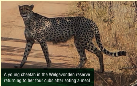
A young cheetah in the Welgevonden reserve returning to her four cubs after eating a meal

To read more about both their adventures, visit our website Latest News pages.