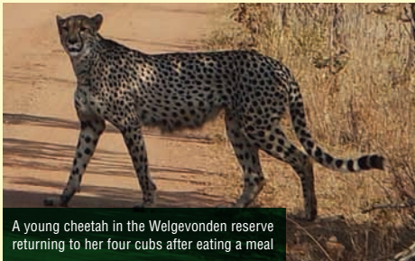
A young cheetah in the Welgevonden reserve returning to her four cubs after eating a meal

To read more about both their adventures, visit our website Latest News pages.