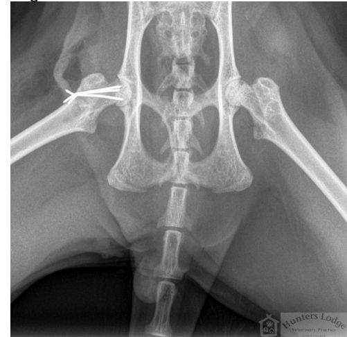
Post op radiograph with pins in hip

complicated operation as the bones and pins used are so small. Grant was the man for the job and after a while in theatre he had managed to get Ginger's bones back into alignment.