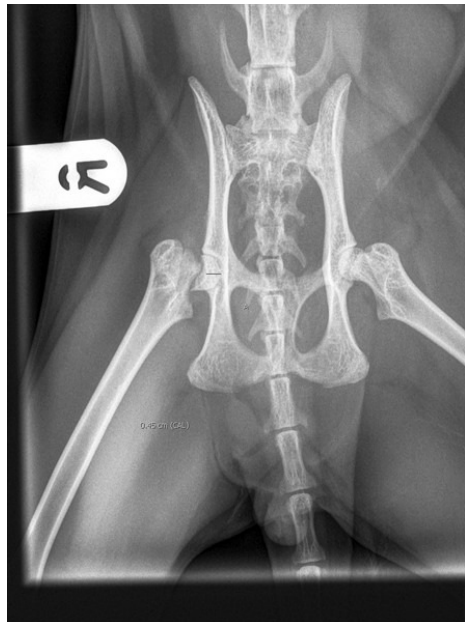
Fracture of Hip

After a short course of painkillers Ginger had improved but he was still a bit stiff. We decided to take some radiographs and this is what we found.