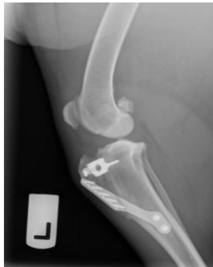
X ray of knee joint after TTA procedure

Surgery. There are many different surgical options for this problem. Which one we choose depends on the size of the patient. We usually perform a procedure called a lateral fabellar suture which stabilises the joint. For a heavier or very active dog we will sometimes refer for a TTA or TPLO procedure. We are now able to offer TTA cruciate surgery at Hunters Lodge rather than referring to a specialist. If we think your dog may be an ideal candidate for this procedure we will book you an appointment with Grant who will be able to discuss all the options with you.