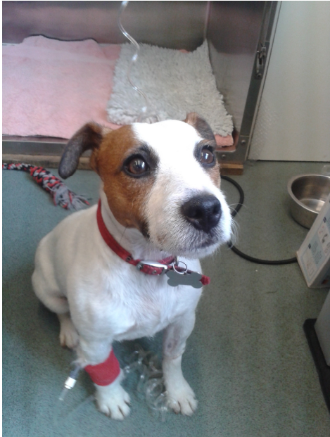
Pepper: 5 days after her ordeal