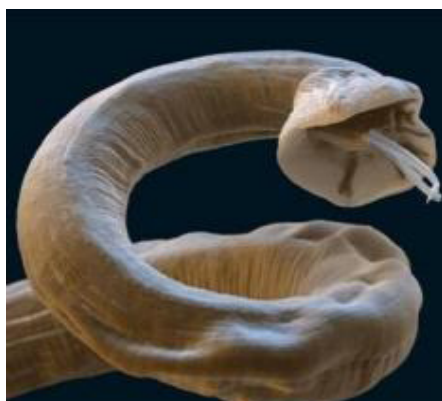
Lungworm: Adult worm

We took some x rays of her chest and found a fluffy pattern in the lungs and the heart looked a little bit enlarged. All these signs suggested lungworm in such a young dog.