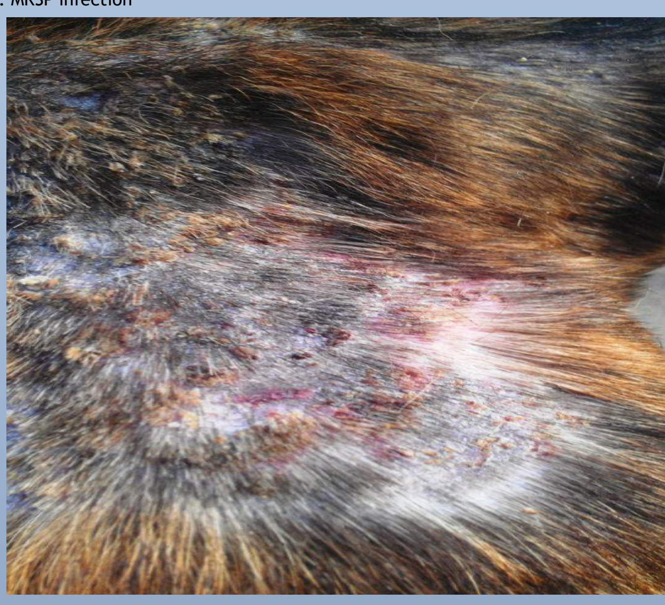
Figure 1: MRSP infection

Samples for culture and antimicrobial susceptibility testing should be collected from non-responsive skin and ear infections in particular, in order to determine the best therapeutic option. (See Fig. 1) In order to prevent spread of infection from MRSP cases to other animals and the environment, strict adherence to hygiene protocols in veterinary clinics and hospitals is essential.